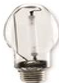
ED17 MEDIUM BASE LU150/MED