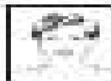
Portrait of a man