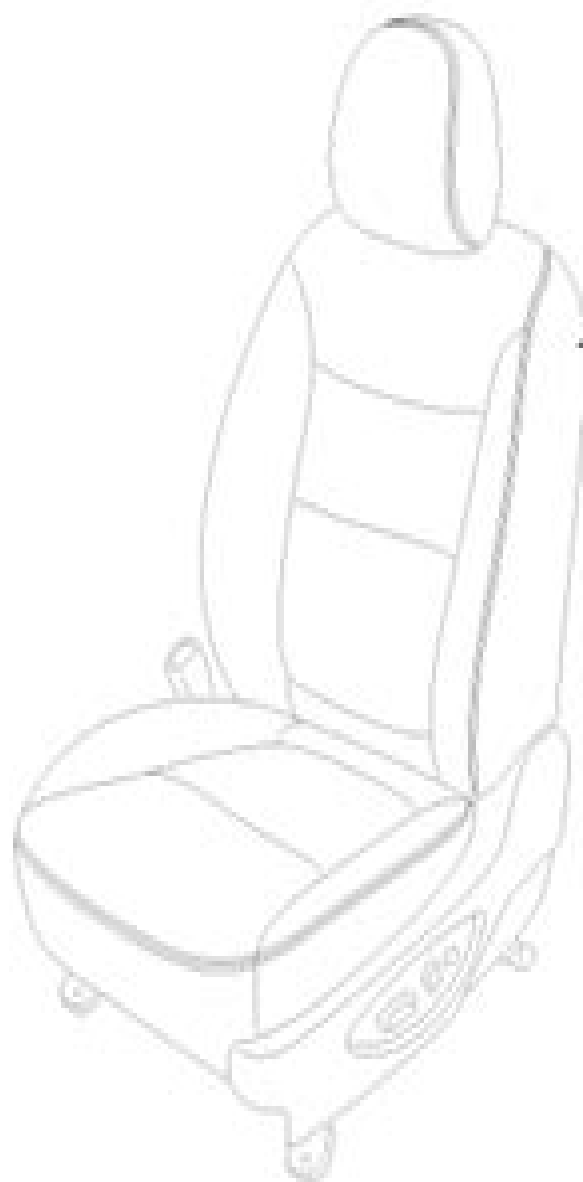
Side Airbag (SAB)