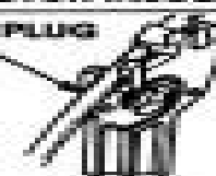
SPARK PLUG WIRE