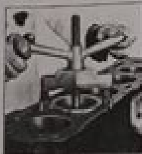
TABLE 2 SUMMARY OF STUDY DESIGN