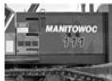
30 Side Support for boom and multiplier of mechanical force. Used with multiplier and boom system to raise and lower boom and to add small crane counterweights.