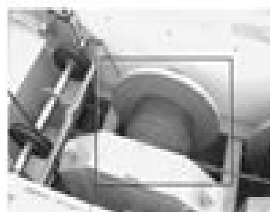
30 Side Support for boom and multiplier of mechanical force. Used with multiplier and boom system to raise and lower boom and to add small crane counterweights.