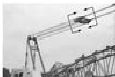
30 Top Support for job