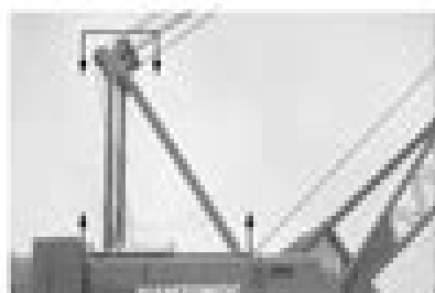
30 Side Support for boom and multiplier of mechanical force. Used with multiplier and boom system to raise and lower boom and to add small crane counterweights.