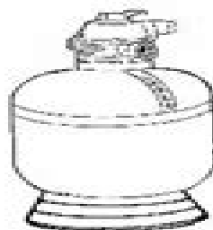
Laser L160, L190