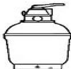
MFM L225, L250 MFM15, MFM17

This step-by-step installation and maintenance guide will provide the necessary information for you to easily maintain the equipment.