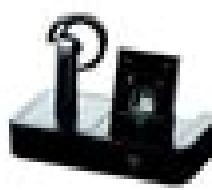
Journal of Health Politics, Policy and Law