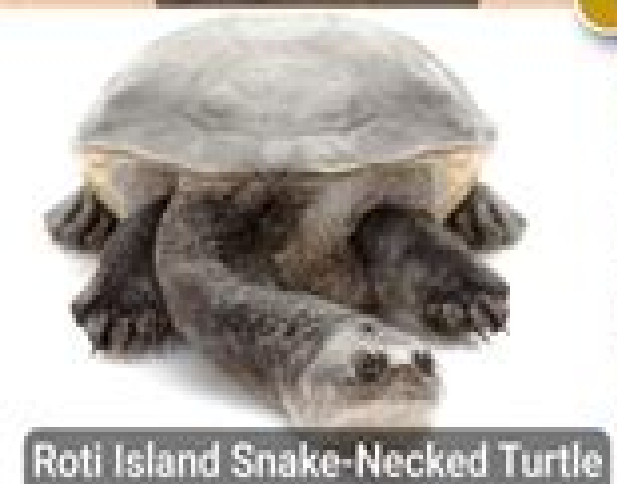
Roti Island Snake-Necked Turtle