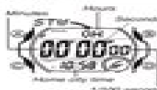
Alarm city time

The stopwatch lets you measure elapsed time, split times, and lap times. • The display range of the stopwatch is 23 hours, 59 minutes, 59.99 seconds. • The stopwatch continues to run, restarting from zero after it reaches its limit, until you stop it. • Exiting the Stopwatch Mode while a split time is frozen on the display clears the split time and returns to elapsed time measurement. • The stopwatch measurement operation continues even if you exit the Stopwatch Mode. • All of the operations in this section are performed in the Stopwatch Mode, which you enter by pressing (2).