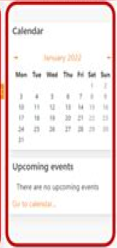
Right information blocks.