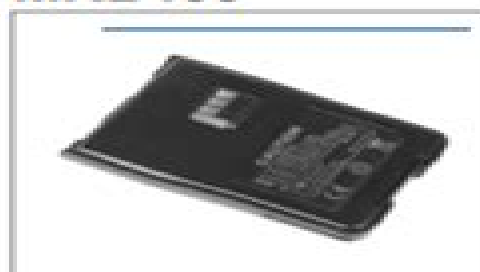
Li-Ion Spare Battery