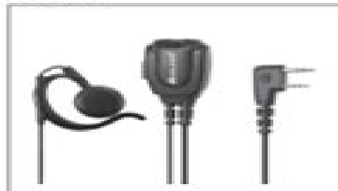
Over the Ear Headset