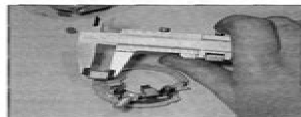
31.8 Measure the length of each brush

9 Inspect the commutator bars on the armature for scoring, scratches and discoloration (see illustration). The commutator can be cleaned and polished with crocus cloth, but do not use sandpaper or