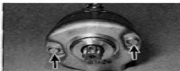
31.3a Starter motor long bolts (arrowed) - 550 models