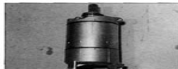
31.2 Note the alignment marks between the main housing and the covers