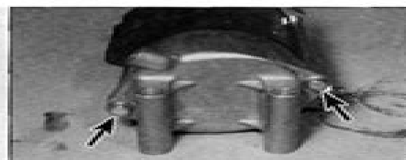
31.3b Starter motor long bolts (arrowed) - 750 models