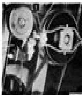
Fan protection (Shield removed)

Later protection, remove the nut from the fan speed control and swing the shield to the right.