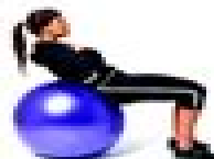
03. back extension