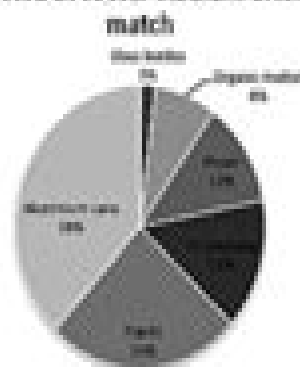
Waste collected at soccer stadium after Saturday match