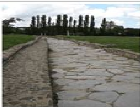
Voie romaine à Saint-Romain-en-Gal