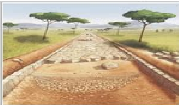
Coupe d'une voie romaine