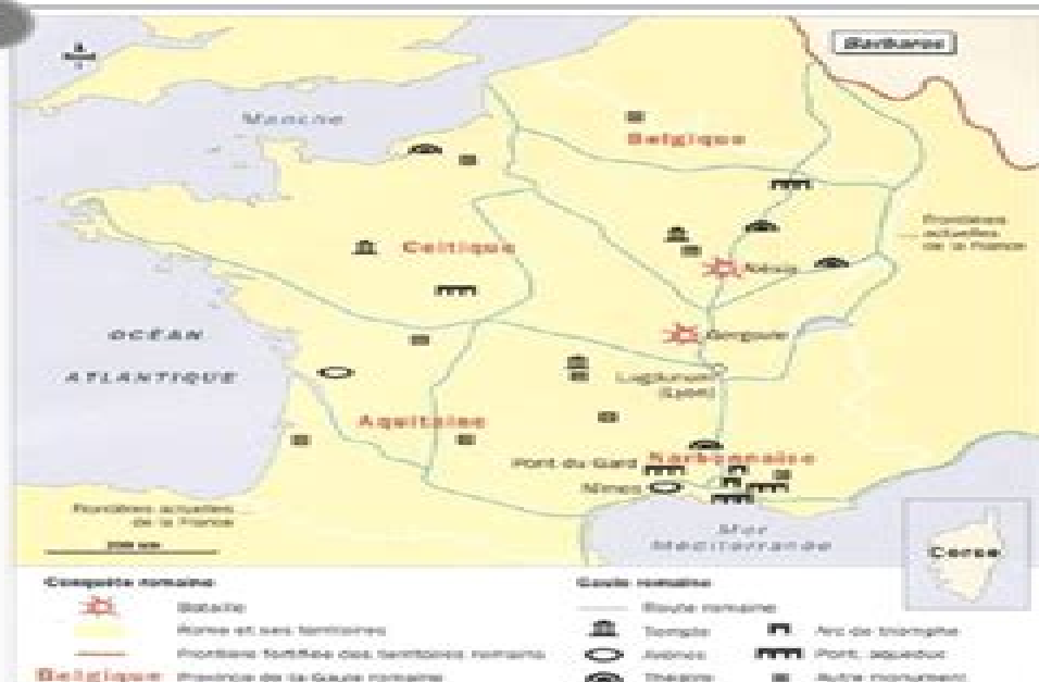
La Gaule romaine : I er siècle av. J.-C. – V ème siècle ap. J.-C.

Source : Histoire cycle 3, Magellan (Hatier)