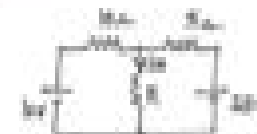
Fig. No. 1