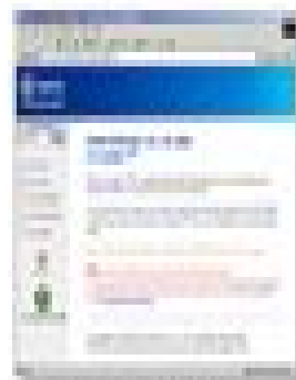
Fig. 2-2. MSI Live Update 3 ™ web page