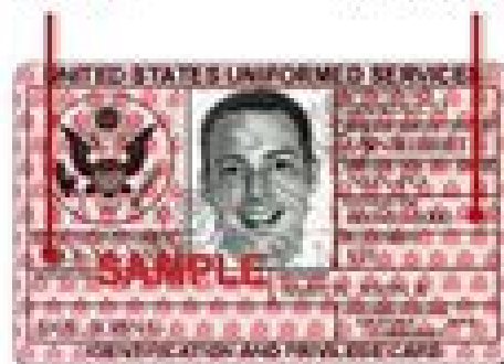
DD Form 1173-1