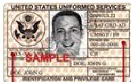
DD Form 1173