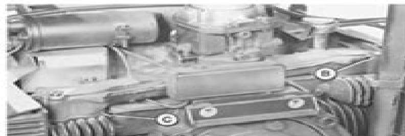
B43E, B43G, B48G Engines