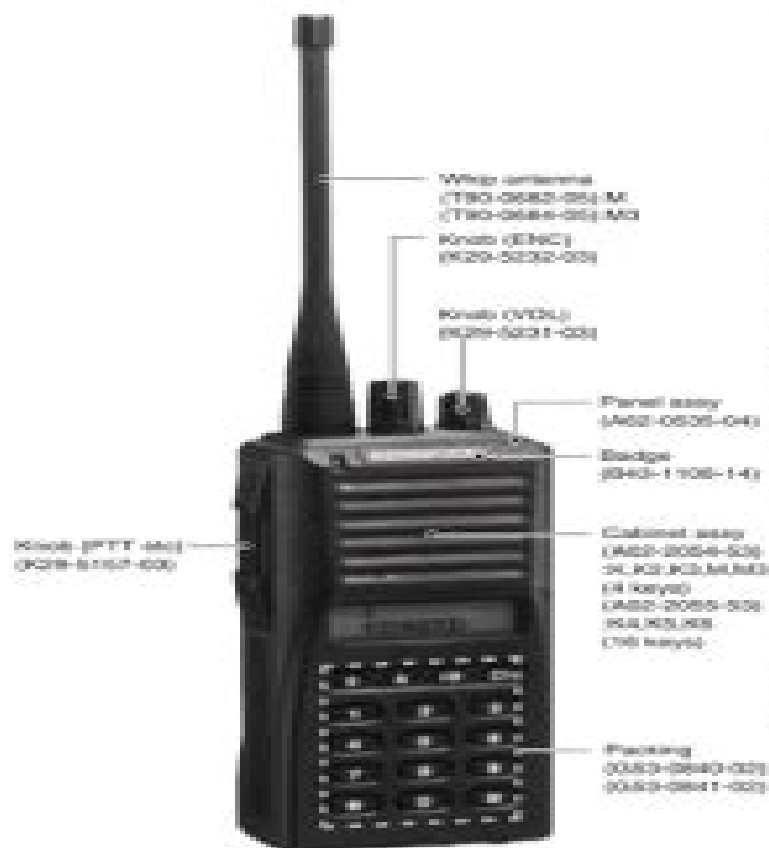
Photo is K4 type with KRA-15

This service manual is same as the TK-380(B51-8455-001) service manual with destination K, K4 and M with the exception of new destination, K2, K3, K5, K6 and M3.