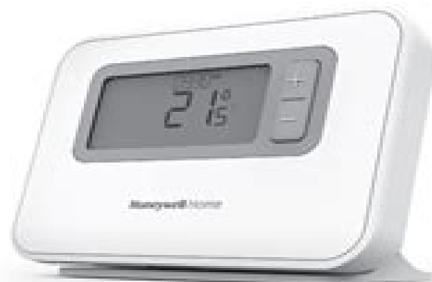
T3R Wireless Programmable Thermostat