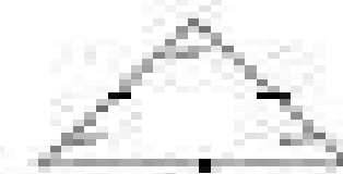
Equilateral triangle Equilateral triangle

A regular polygon is a polygon in which all sides are congruent and all angles are congruent.