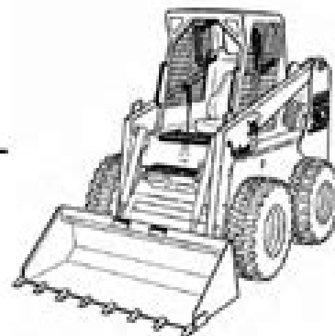
Illustration Copyright © 2007 Bobcat Corporation

Service personnel should always wear approved safety clothing and use of approved safety tools. Signs on other equipment displaying such warnings as "Approved Safety Clothing" or "Use of Approved Safety Tools" are required in order to use the product in a safe manner. Signs on the machine to require a person wearing approved safety clothing and using approved safety tools are required in order to use the product in a safe manner.