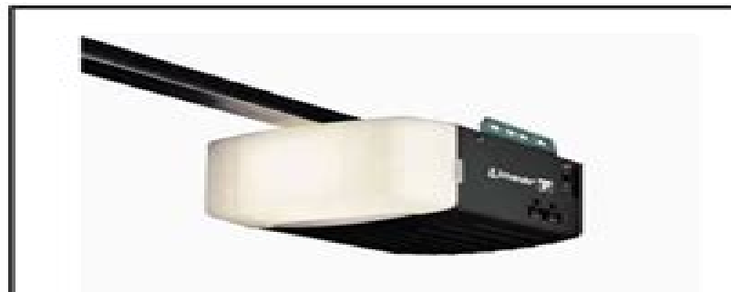
LDO33 and LDO50 Garage Door Operators

The date of manufacture is stamped on the outside of the operator's packing box above the product identification label. If the product has already been corrected at the factory, a light blue dot will be seen on or near the label. Operators produced after April 7th, 2008 have the correct preset open limit setting and no field action is required.