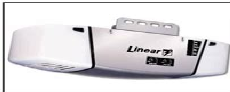
LSO50 Garage Door Operator