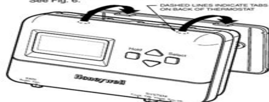
A ENGAGE TABS AT TOP OF THERMOSTAT WITH SLOTS ON MOUNTING PLATE.

DASHED LINES INDICATE TABS ON BACK OF THERMOSTAT