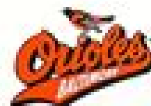
HOME BATTING PRACTICE JERSEY