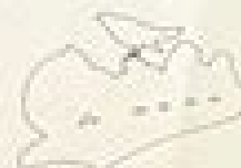
WHITE PLATE Outline - does not print

All rights, title and interest in these trademarks are governed exclusively by Major League Baseball Properties. Any commercial use of these marks must be approved by Major League Baseball Properties.