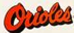
OFFICIAL TEAM LETTERING