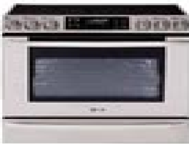
Electronic Control Panel

The LSE3092 features a 60°C to 260°C temperature range, providing precise control for a variety of cooking tasks. With 25 preset functions and 5 manual presets, it offers a wide range of cooking options. The oven's 25-liter capacity is ideal for preparing large meals. The electronic control panel provides a user-friendly interface for setting temperature and time. Safety features include a locking system to prevent accidental opening during cooking. The cooktop is equipped with two powerful heating elements for efficient cooking.