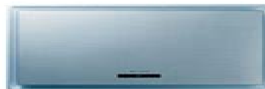
Mini-Split ARTCOOL™ Indoor Unit Metal Finish