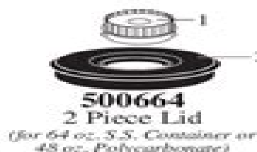
500664 2 Piece Lid (for 64 oz. S.S. Container or 48 oz. Polycarbonate)