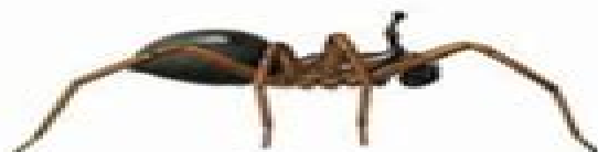
34. Money Spider Walckenaeria acuminata ♂ 3 mm