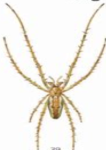
39. Long-jawed Orbweb Spider Tetragnatha montana ♀ 10 mm