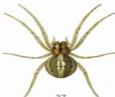
37. Long-jawed Orbweb Spider Pachygnatha clercki 6 mm