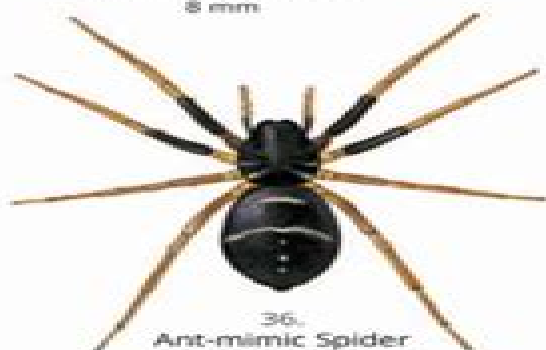
36. Ant-mimic Spider Micaria pulicaria ♀ 4 mm