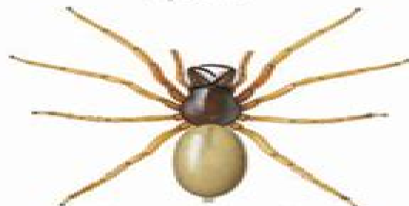
38. Woodlouse Spider Dysdera crocata ♀ 12 mm