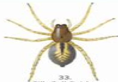
33. Silk Cell Spider Clubiona corticalis 8 mm