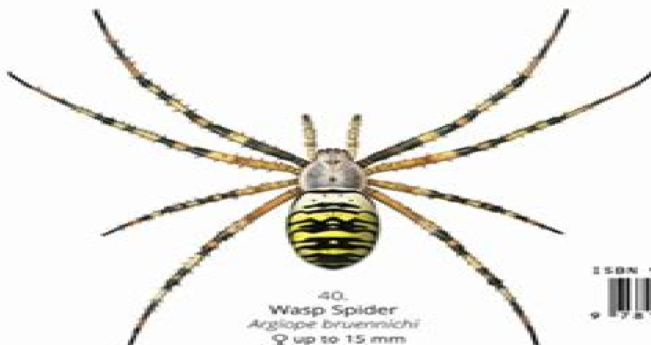
40. Wasp Spider Argiope bruennichi ♀ up to 15 mm