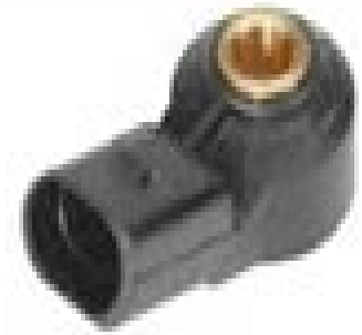
Engine Knock Sensor