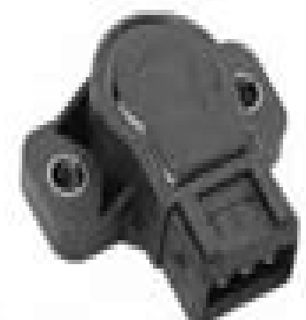
Throttle Position Sensor