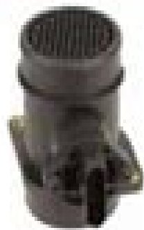
Air Flow Sensor