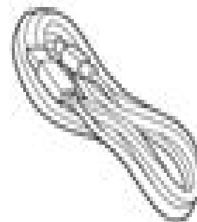
USB Type C™ Charging Cable