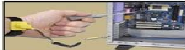
Wearing the Anti-static Wrist Strap Correctly

Use an inexpensive antistatic wrist strap. Make sure you are wearing your antistatic wrist strap correctly (it does you no good at all if you do not wear it!), and you are ready to proceed.