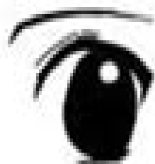
TSUBASA CHRONICLES CLAMP