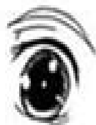
KYO KARA MAOH