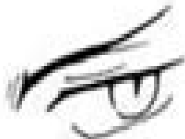
TSUBASA CHRONICLES CLAMP