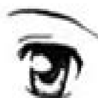
DETECTIVE LOKI SAKURA KINOSHITA