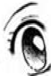
FRUITS BASKET NATSUKI TAKAYA