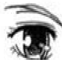
KYO KARA MAOH