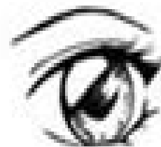
DEMON DIARY AI BY KARA