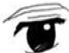
TSUBASA CHRONICLES CLAMP