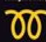
Engine management lamp