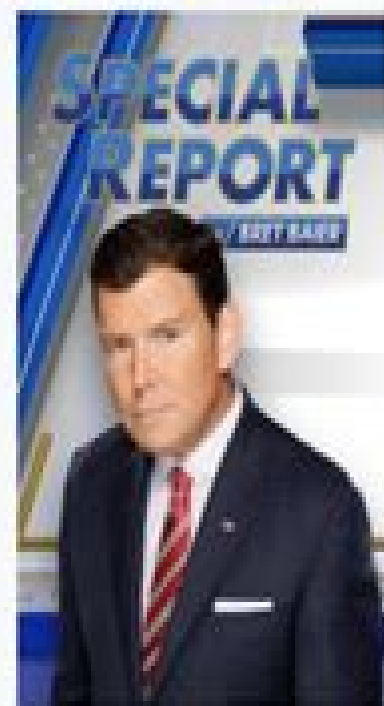
Special Report with Bret Baier