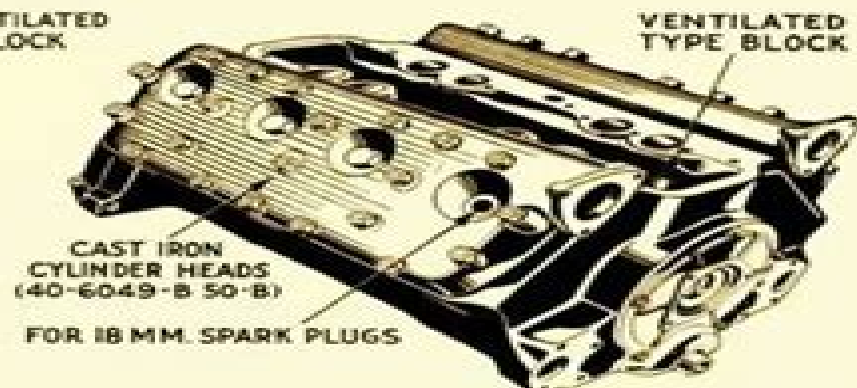
51-6012—(FOR 1935, 1936 TRUCKS)