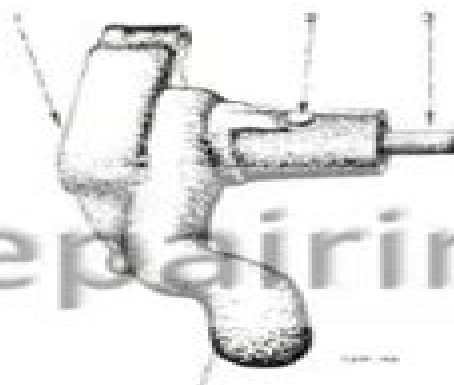
Illustr. 14. Water pump, spindle bearing, and retainer bolt. 1. Water pump 2. Retainer bolt 3. Spindle bearing