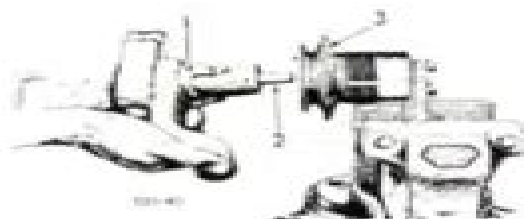
Illustr. 13. Removal of spindle bearing from pulley sub-step 3.