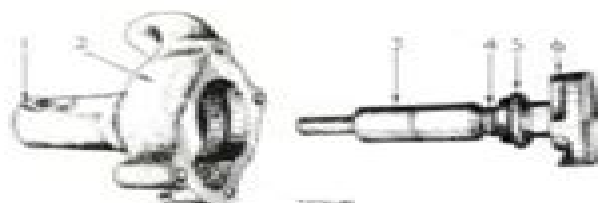
Illustr. 15. Spindle bearing and impeller pressed out of water pump.