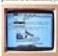
For more information on the new book, visit www.pearsoned.com/9780130354379 .

Thanks to its size, if you can't bring the problem to a Macintosh, you can always