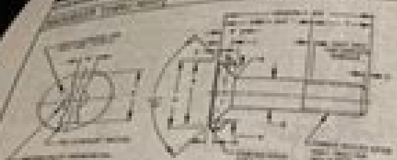
REPLACEMENT TABLE FOR SPECIFIC WORK ONLY AND SHOULD BE USED FOR REPAIR ONLY