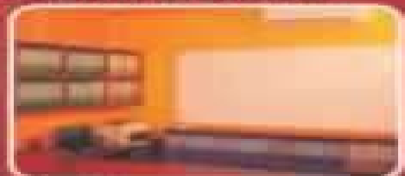
Learning facilities at Benchmark

Benchmark is focused on exceptional academic performance. Parents/Guardians are invited to arrange an appointment with the Director-Academic for an initial discussion.