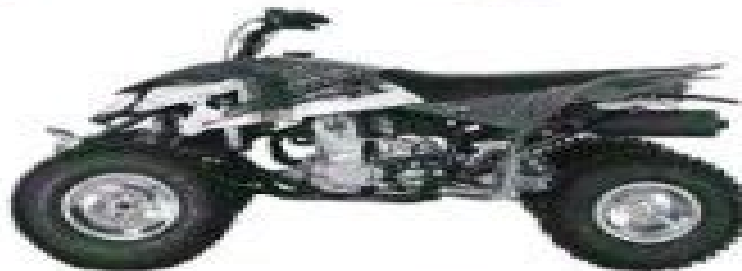
OUTLAW 525 S