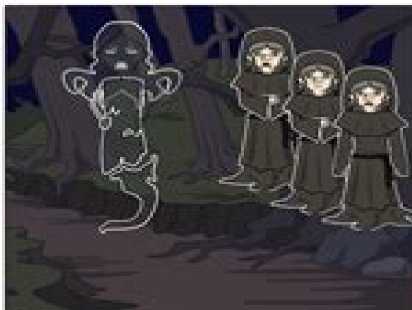
Act 3 Scene 5

Hecate is angry with the three witches for meddling in to Macbeth's life. She decides that they have to destroy Macbeth's life by making him think he is invincible.