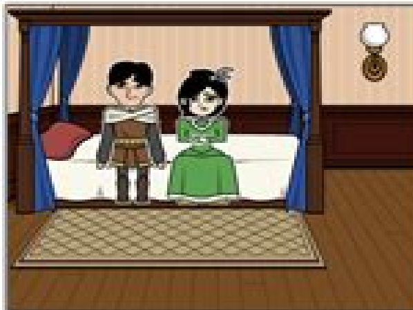
Act 3 Scene 2

Lady Macbeth and Macbeth do not feel like they are able to enjoy their royalty because of all the bad things they have done. Lady Macbeth tries to cheer Macbeth up. Macbeth's corruption continues and he keeps Banquo's murder a secret from his wife.