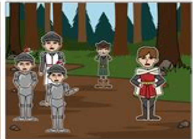
Act 3 Scene 3

The two murderers find that Macbeth has sent a third murderer to help them ambush Banquo and Fleance. Banquo is killed and Fleance escapes.