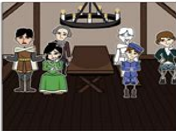
Act 3 Scene 4

The murderers return to the castle and tell Macbeth what has happened. Macbeth returns to the state dinner to find that there are no seats left. Banquo's ghost has occupied the last seat and only Macbeth can see that. Macbeth becomes outraged at the ghost and eventually Lady Macbeth tells their guests to leave.