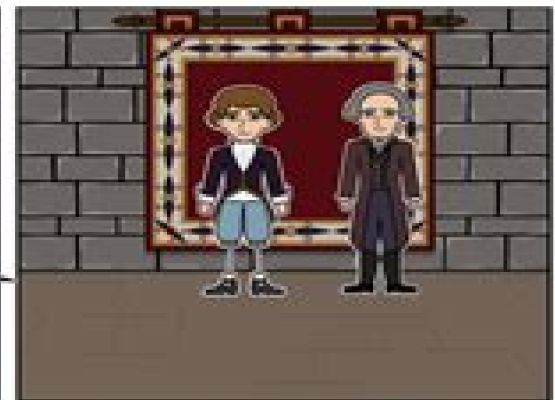
Act 3 Scene 6

Lennox and a lord talk about the past events. They conclude that Fleance killed Banquo, Duncan's son killed Duncan and that Macbeth isn't a good man. They also reveal that Macduff and Malcolm have gone to England and are raising an army to invade Scotland.