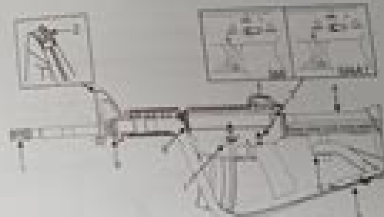
COMPENSATOR (1) helps prevent the muzzle from rising while firing. FRONT SIGHT POST (2) adjusts wind up/bullet up or down. SELECTION LEVER (3) selects mode of fire and places weapon on safe. ADJUSTABLE BUTTSTOCK ASSEMBLY (4) houses spring and buffer mechanism. It absorbs and reduces recoil.

The coronary heart group shows the same functions of the heart and coronary systems. The path of the gas goes by following from the coronary tree through the coronary artery, the heart coronary artery, the coronary sinus (chamber) is found between the back of the heart and the aorta.