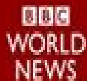
BBC WORLD NEWS