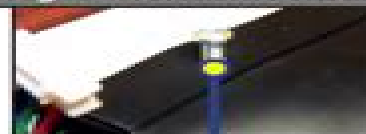
Fig. 4 - Retention Screw