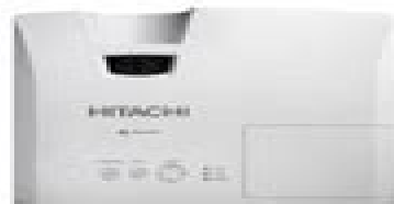
Screen Size 4:3 Throw Distance