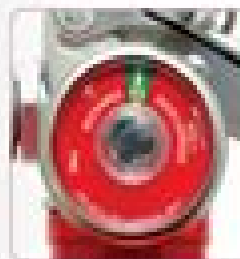
Fire extinguisher pressure gauge showing the correct pressure.