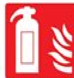
Fire extinguisher point sign.